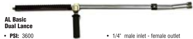
AL Basic Dual Lance