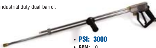
Dual Barrel Dump Gun