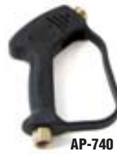
AP-740 Open Gun