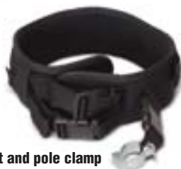
Belt and pole clamp