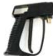
Hobby Wash Gun