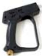
AP-1000 Open Gun