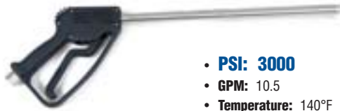
AP Single Barrel Dump Gun