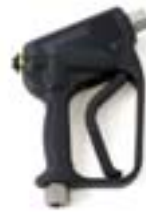
Model RL84 "Big Black Gun"