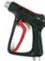
ST-3002 Stainless Steel Gun