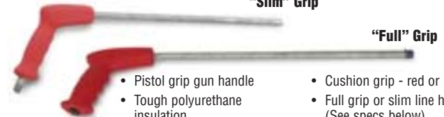
Gun Handle only