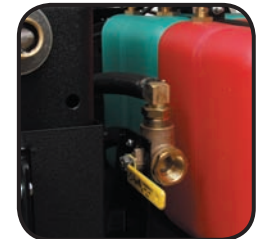
Three-way ball valve for inlet water selection*