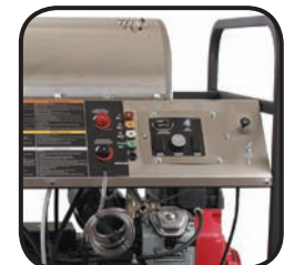
Stainless-steel coil wrap and control panel*