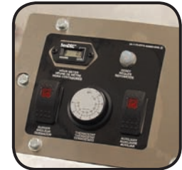
Control panel includes 120V/15-amp auxiliary duplex GFCI outlet*