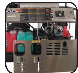
Stainless-steel removable front panel for access to pump*