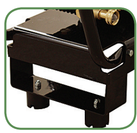
3/16-inch powder coated and welded steel base plate